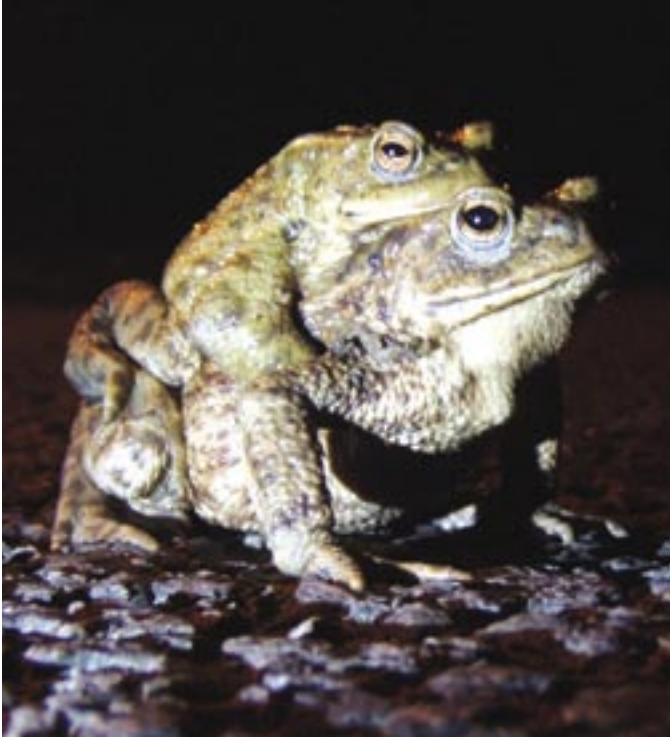
Toads in amplexus: The male clings onto the female on the way to spawning where the female lays the eggs for the male to fertilise.

Volunteers have successfully saved hundreds of toads from being squashed on their way to spawning sites. BTCV explains how the rescue effort was organised.