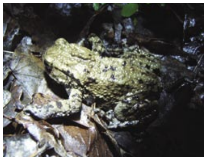
Toads on their way to spawning sites.